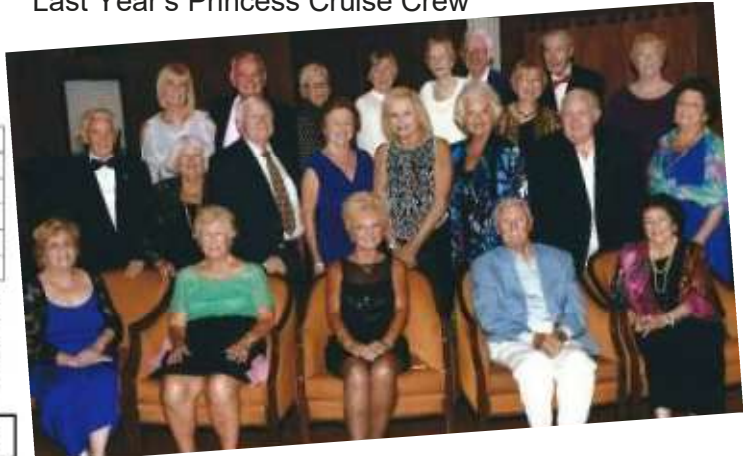
Last Year's Princess Cruise Crew

Call to reserve your cabin now. Tours and Cruises Unlimited (561) 202-9020