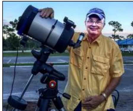
Recent Celestial Tools

This led to studies of Lewis and Clark's celestial data. In more recent years, his interest in celestial objects has been in the form of amateur astronomy. His squadron involvement has included upgrading the squadron's library holdings at headquarters, the introduction of PowerPoint teaching materials (resulting in his own Chapman Award in 2003), and proposing and implementing the in-house Roster and Afterdeck printing capability (at a great cost savings to our squadron's annual budget). His more recent interest in celestial objects finds him supporting parallel astronomy outreach programs and out camping and taking stunning pictures to share with family, distant friends, and occasional squadron programs. You may recognize him as the one at the lunch bunch "with stars in his eyes" (and on his iPad).