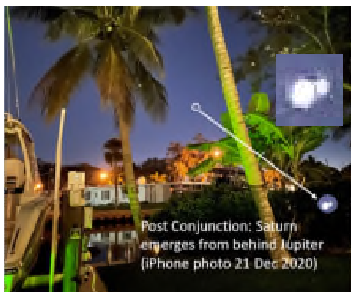
Post Conjunction: Saturn emerges from behind Jupiter (iPhone photo 21 Dec 2020)

This is to show that we practice the safe boating techniques that we teach.